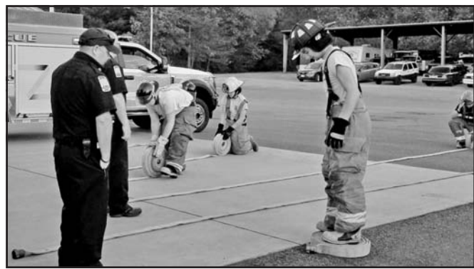
Junior Firefighters learning how to throw firehose and roll it back up again.

The mission statement of the Union County Fire Department Junior Firefighter Program says it all: "To provide an opportunity to